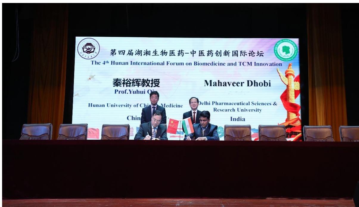
MoU Signing Ceremony between DPSR University, India and Hunan University of Chinese Medicine, Changsha, China.

A MoU was also signed during the conference between DPSR University, India and Hunan University of Chinese Medicine, Changsha, China.