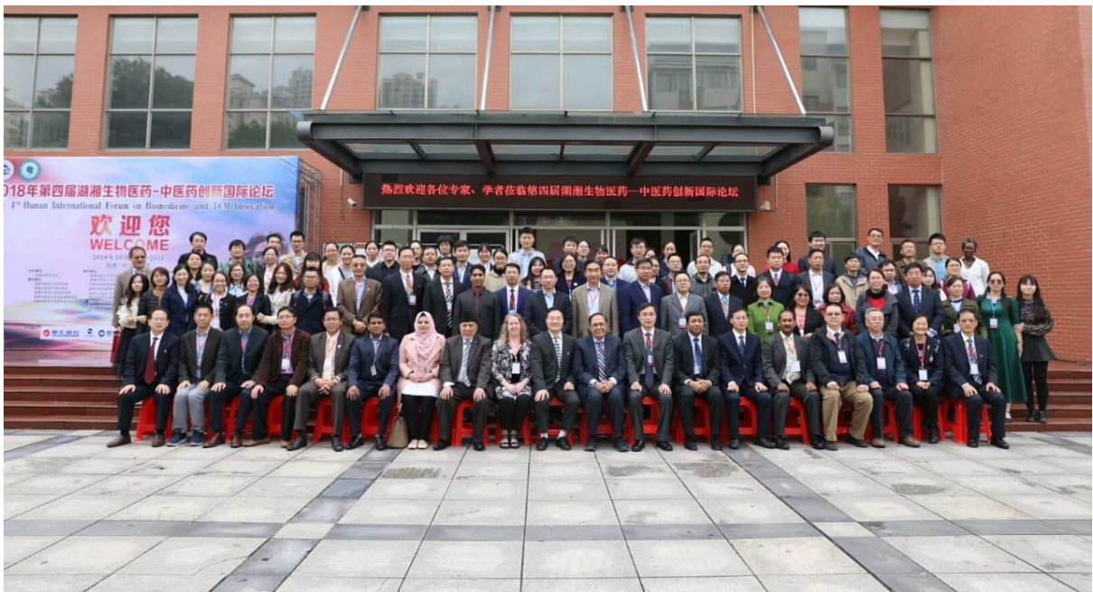
Delegates at “4th Hunan International Forum on Biomedicine and TCM” Changsha, China.