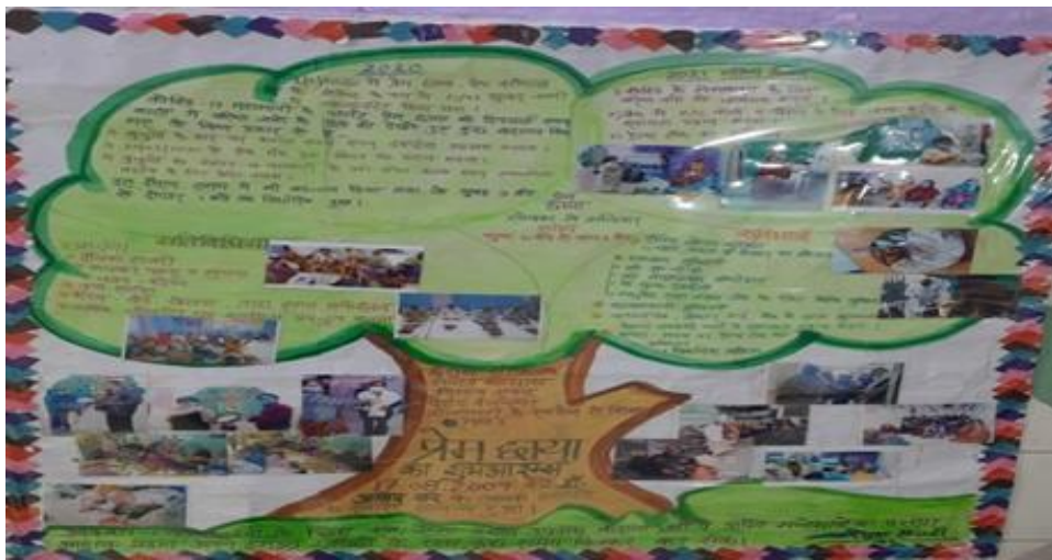
Family tree made by members of PremChaya

Prem Chhaya, senior citizens day care center started by CHD-SSH is a place where old and powerless senior citizens can interact with their peers. They are also provided with food, entertainment and place to lie-down. Regular Health Checkups are conducted and those needing advanced care are referred to speciality hospitals. Periodic picnics and outings are also arranged. This recreation center is funded and managed by "Patient Welfare Society St. Stephen Hospital". The MPH students visited PremChaya and interacted with the senior citizens. Due to Covid 19 pandemic the day care facility can be availed to a shorter period supporting the medical facilities, breakfast and lunch for senior citizens.