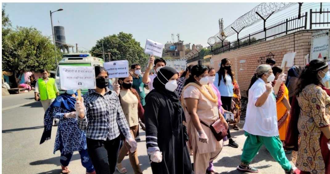
MPH Students participating in Clean India rally (Swachha Bharat Abhiyaan) in the urban slum of Sunder Nagri, East Delhi.