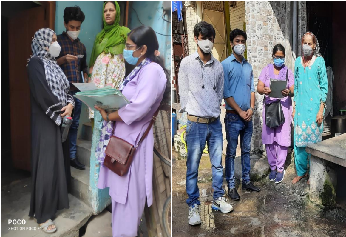
Home visit with ANM in the urban slum area of Sunder Nagri

During the home visit family folders were prepared by the students. Also collected information of the family member i.e. a number of family members, occupation, education, date of birth, religion, income, past history, present illness, use of family planning, immunization etc. in the slum area.