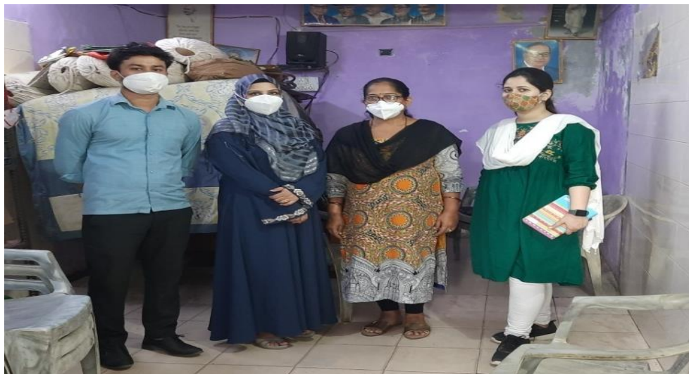
Visit to PremChaya:Senior citizens Day care center