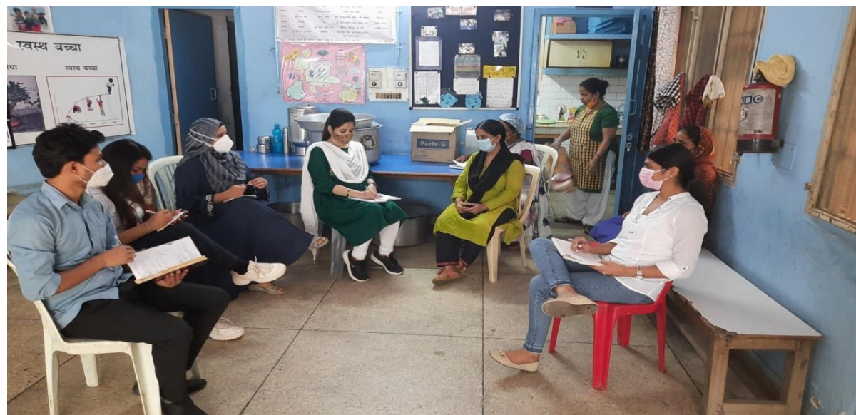
Collecting information on Hunger Relief from a worker at CHD, St. Stephen Hospital