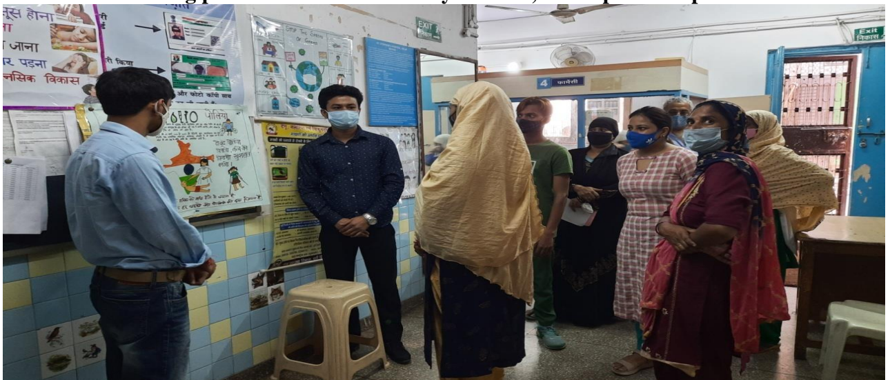
Health Talk to Patients on World Polio Day at CHD, St. Stephen Hospital