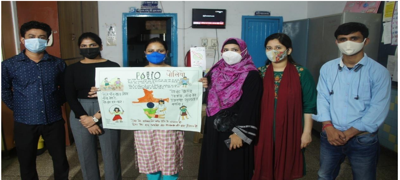
Presenting poster on World Polio Day at CHD, St. Stephen Hospital

people and explain them about Polio. The students explained and interacted with the patients who visited the CHC in multiple rounds.