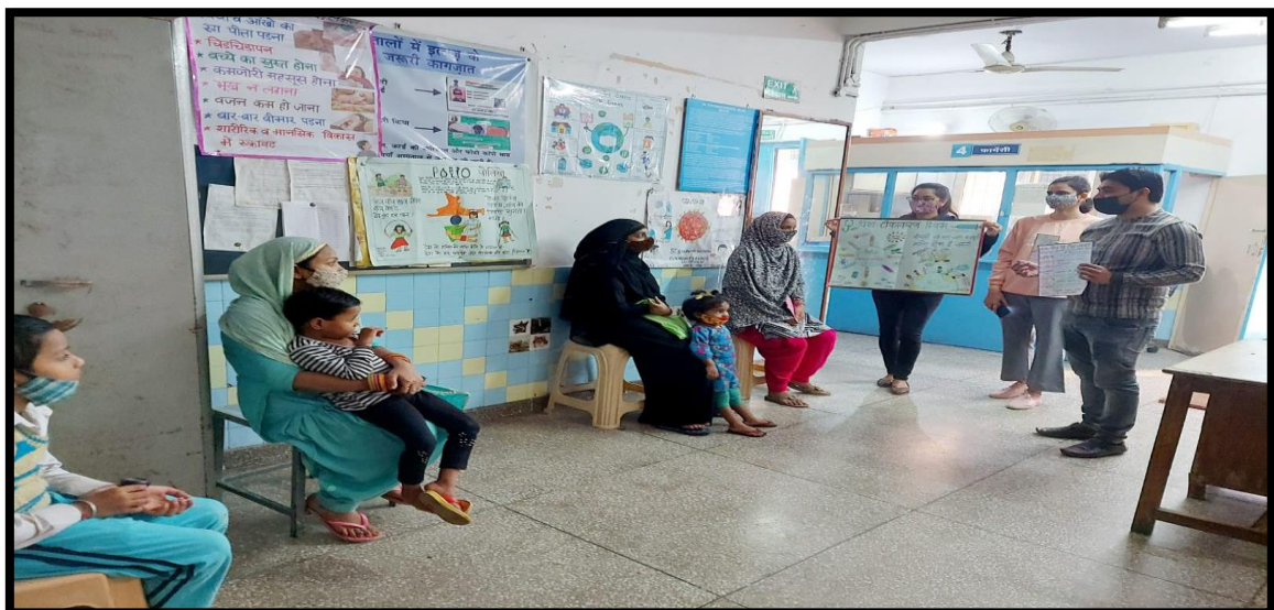
Delivering Health Talk to Patients on World Immunization Day at CHD, St. Stephen Hospital

Every year 10 th November is observed as World Immunization Day. On 10th November 2021 health talk was delivered by MPH Students in Community Health Department (CHD-SSH), Sundar Nagri, to spread awareness among the people and sensitize them regarding Vaccine Preventable Diseases (VPDs) such as Diphtheria, Pertussis, Tetanus, Measles, Cholera, Hepatitis, Rubella, Rotavirus, etc. with the help of vaccination. Handouts were prepared by MPH students explaining the importance of vaccines, benefits of getting vaccinated, facts related to vaccines and National Immunization Schedule. The students interacted with the patients who visited CHD.