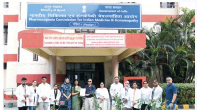
MoU with PCIM&H, Ghaziabad