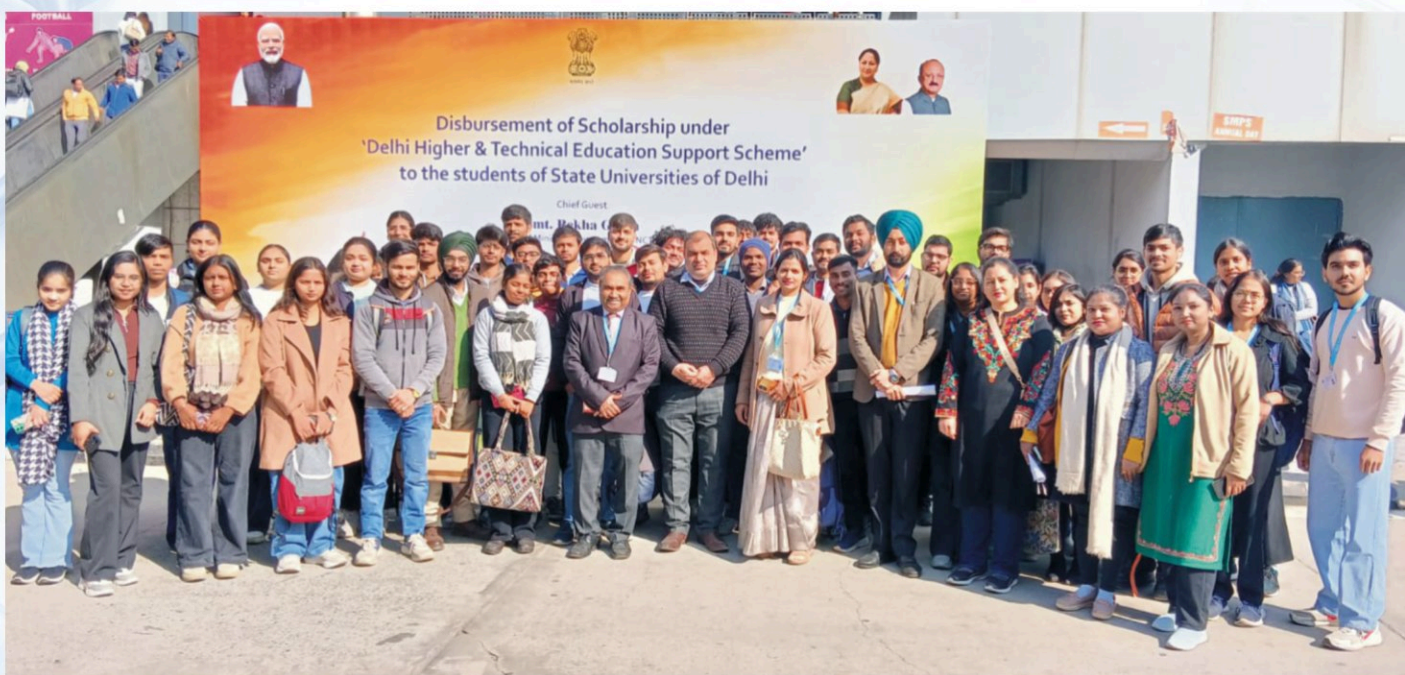
Students of DPSRU at Scholarship Disbursement Program Under Delhi Higher & Technical Education Support Scheme

Indian Pharmaceutical Association (IPA) has instituted the scholarship in the name of Late Sri Ramanbhai Patel for meritorious, deserving and financially needy B. Pharm. students who enrolled in B. Pharm. course at the University. Selected students receive Rs. 25,000/- in the first year and continue to receive Rs. 25,000/- each year till the completion of B. Pharm. as per guidelines of scholarship.