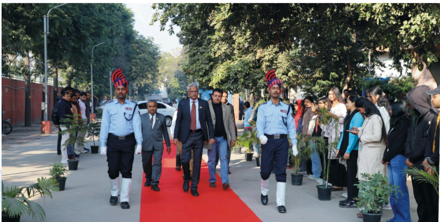
Hon.Vice chancellor, Registrar and Dean Students Welfare arriving at Republic Day Celebration, 2026

These seats are supernumerary and maximum upto 5%.