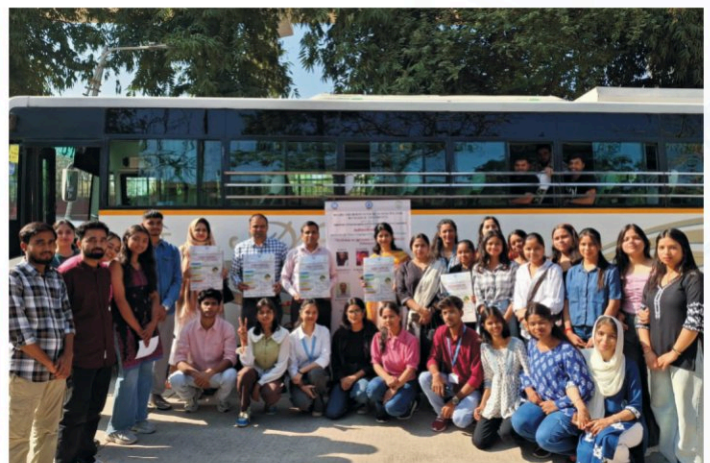
Educational tour of DPSRU Students