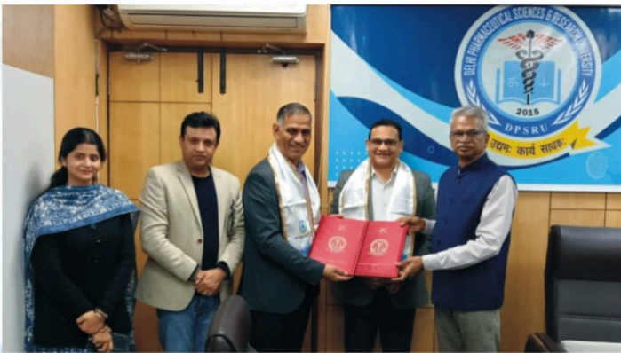
MoU with Ambe Phytoextracts Pvt. Ltd., Pauri Garhwal, Uttarakhand