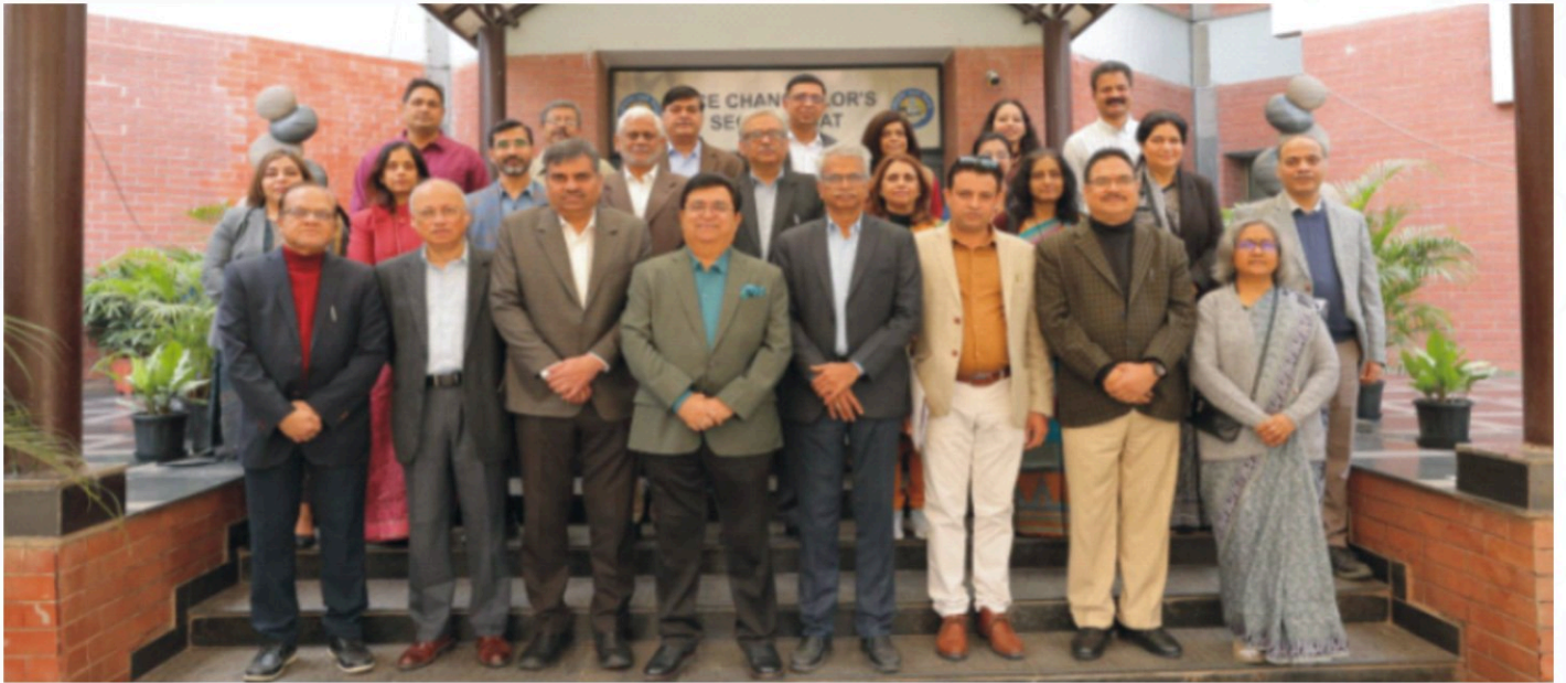
MoU with Guru Govind Singh (Indraprastha University (GGSIU)) New Delhi