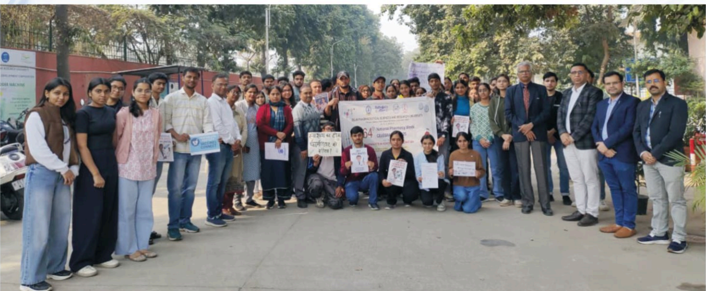
Awareness rally on the occasion of 64th National Pharmacy Week