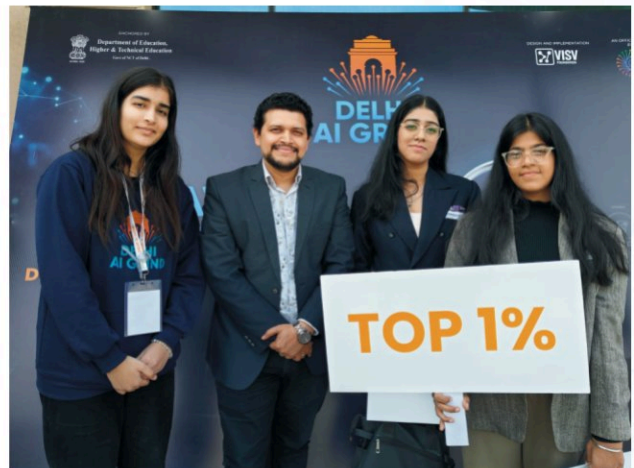
Students of DPSRU at Delhi AI Grind