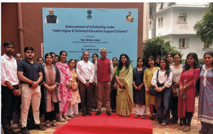
Students of DPSRU with Hon. Vice Chancellor at Scholarship Disbursement Program Under Delhi Higher & Technical Education Support Scheme