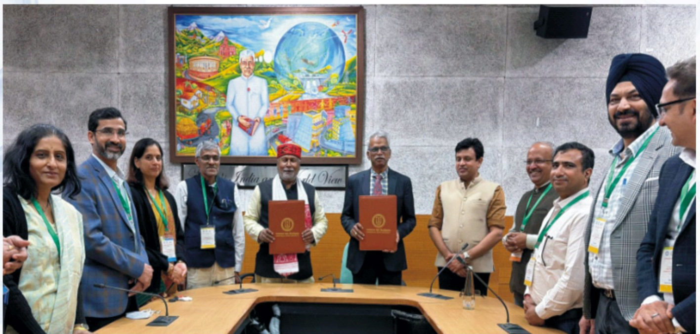
MoU with Central University of Punjab, Bhatinda