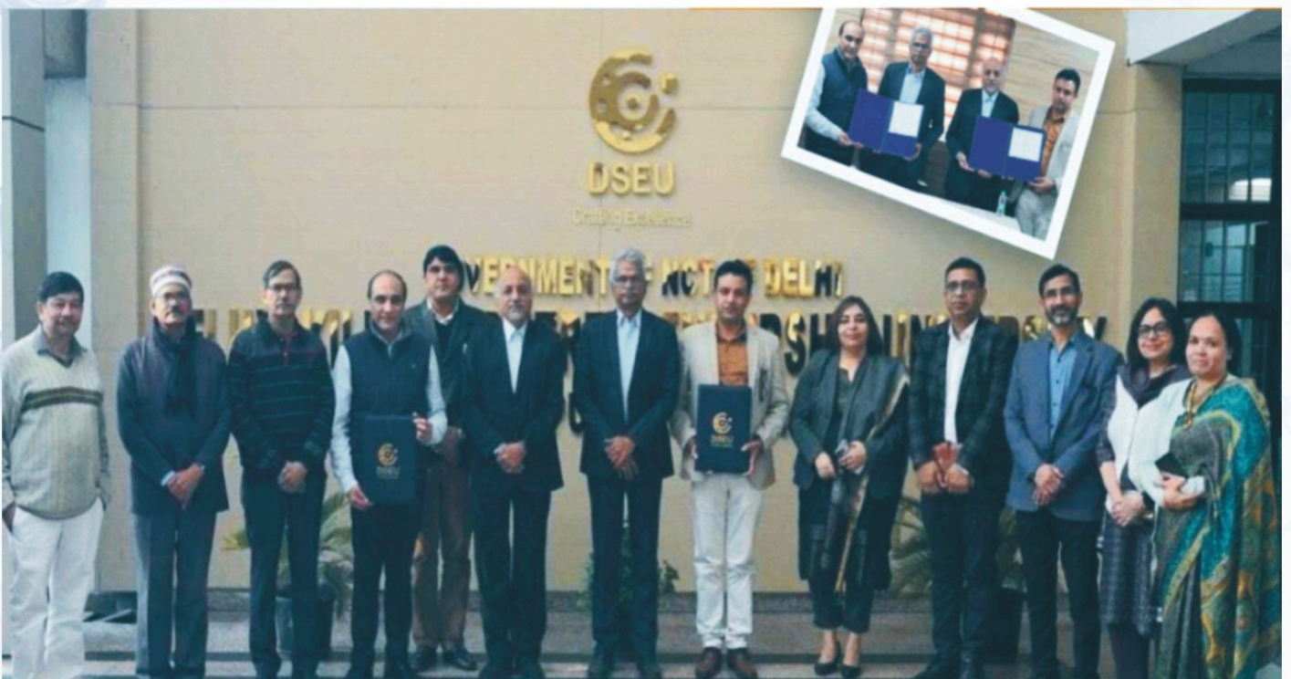
MoU with Delhi Skill and Entrepreneurship University (DSEU), New Delhi