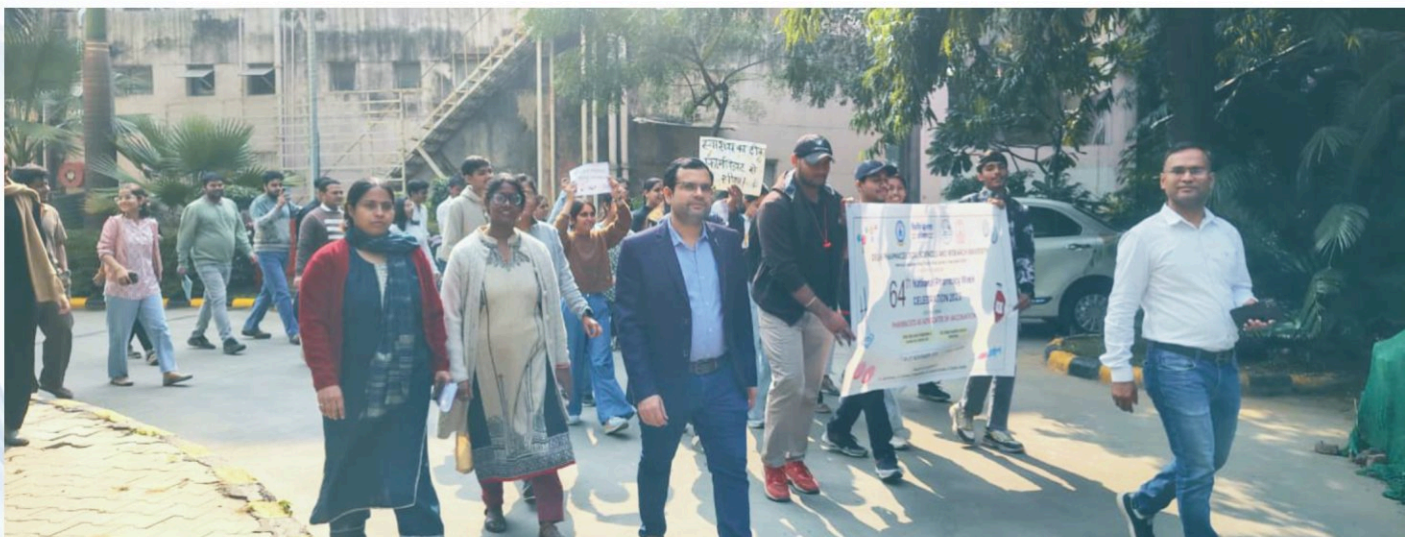
Celebration of National pharmacy week, 2025