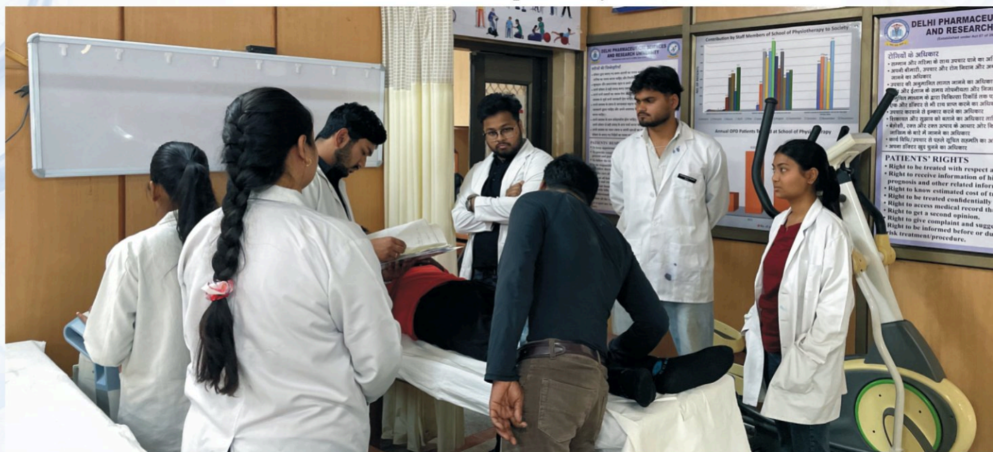
Physiotherapy OPD in DPSRU