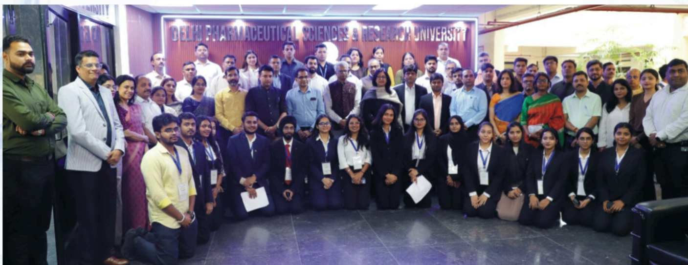
Future Fest:- Placement Drive at DPSRU, 2026