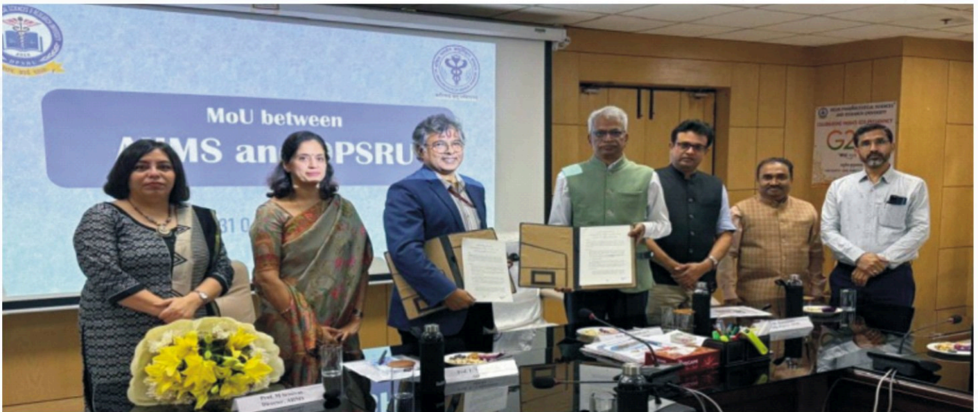
MoU with All India Institute of Medical Sciences (AIIMS), New Delhi