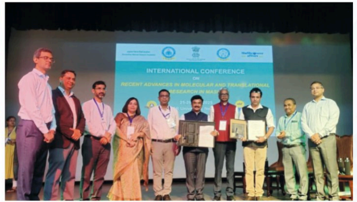
MoU with National Dope Testing Laboratory (NDTL), New Delhi