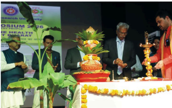
Bhumi Poojan during Bhumi Suposhan Symposium at DPSRU