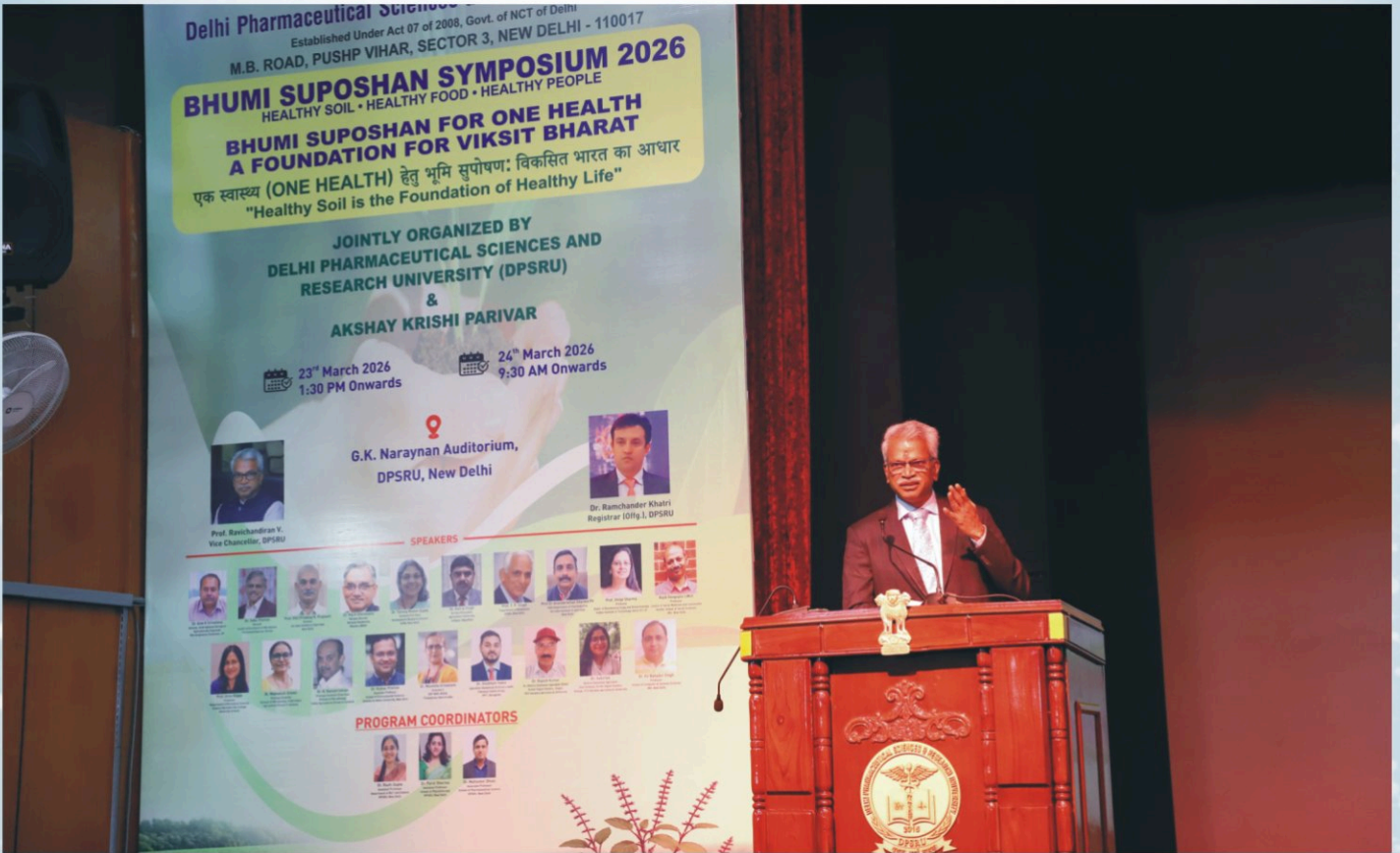
Hon. Vice Chancellor addressing the gathering at Bhumi Suposhan Symposium, DPSRU