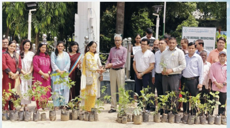
Plantation drive at DPSRU