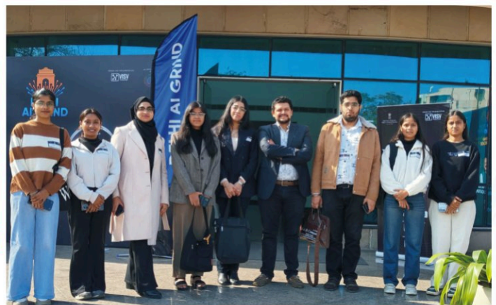
Students of DPSRU at Delhi AI Grind