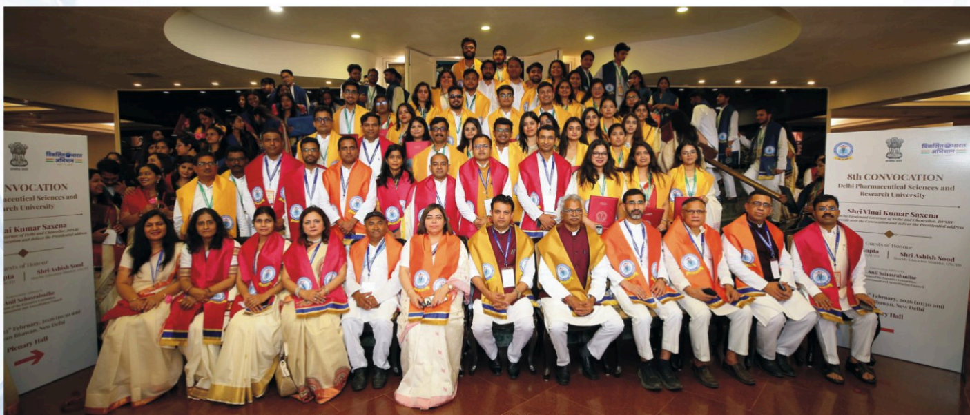
DPSRU 8th Convocation, 2026