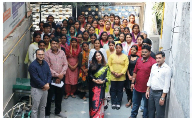
Ministry of MSME, Govt. of India Sponsored Entrepreneur Awareness Program & Management Development Program at DPSRU, 2026