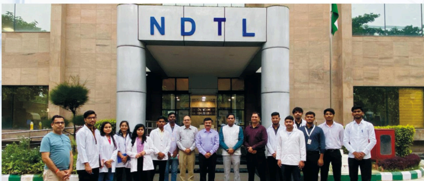
Visit of Students to National Drug Testing Laboratory