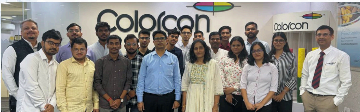
Visit of students to Colorcon Asia Pvt. Ltd.