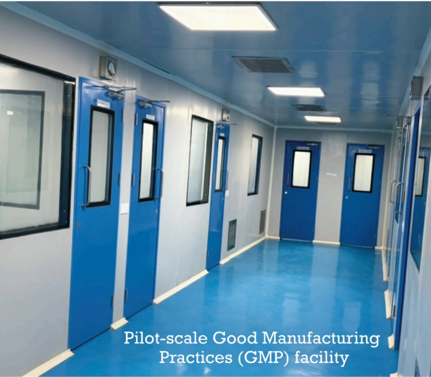
Pilot-scale Good Manufacturing Practices (GMP) facility