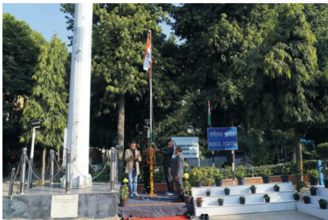
Flag hosting by Hon. Vice Chancellor on Republic day, 2026