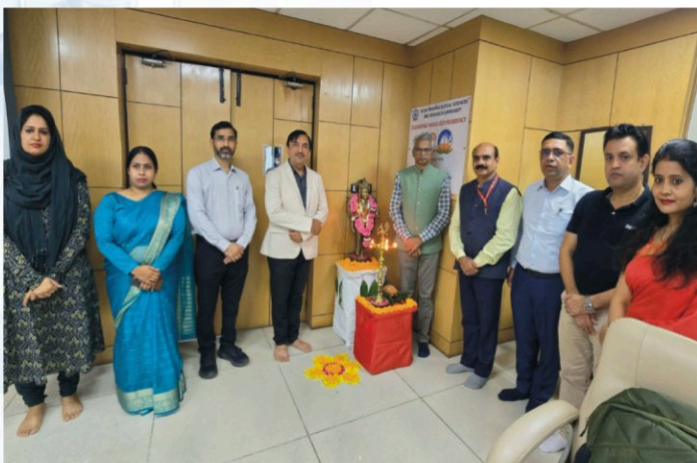
Dhanvantari Poojan on the occasion of Ayurveda Week