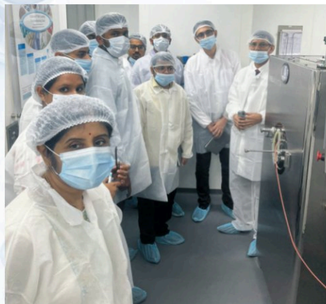
Students of DPSRU during Industrial Visit