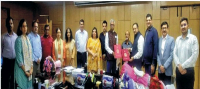
MoU with Federation of Pharma Entrepreneurs