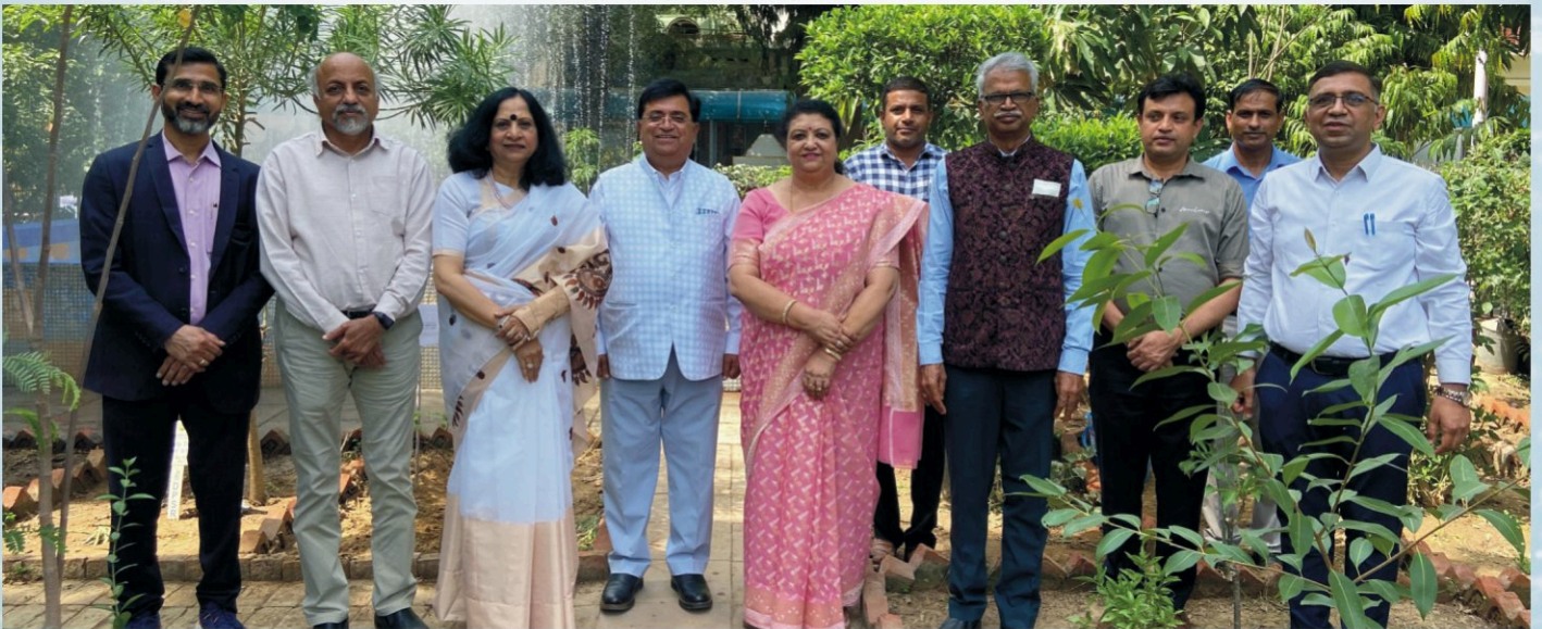
Delhi State Universities Vice Chancellor Forum 2nd Meeting at DPSRU